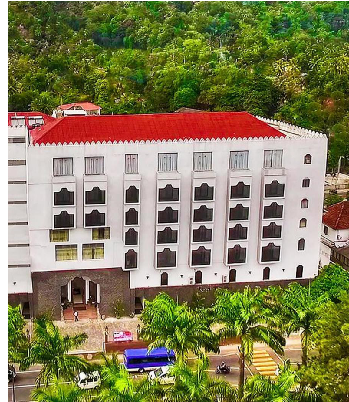
Kandy - Royal Kandyan