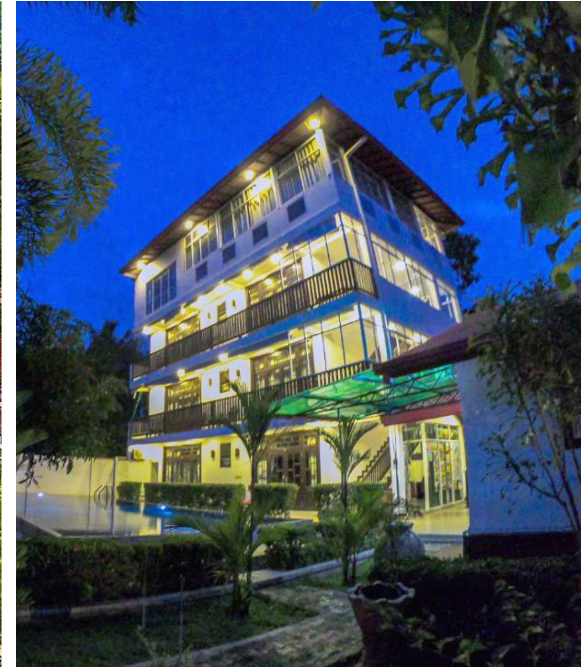
Galle - Kabalan Hotel