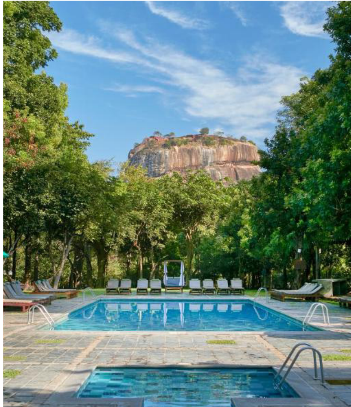
Habarana - Hotel Sigiriya